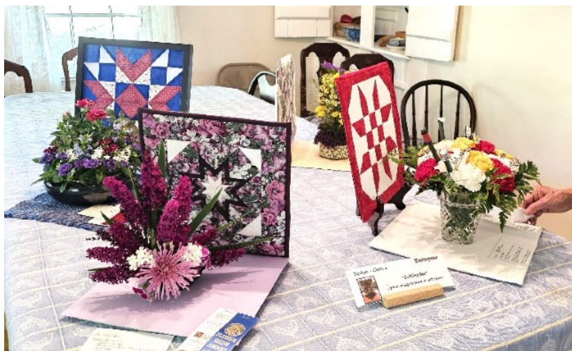
Quilt patch small Meridian Garden Club Flower Show