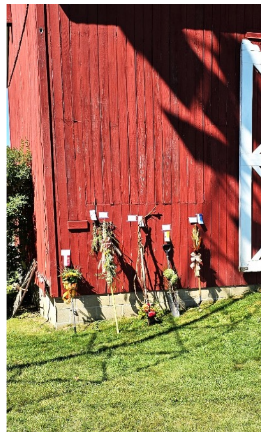
Garden Implements Meridian Garden Flower Show

involved in for 2025 planning for a 2026 show.