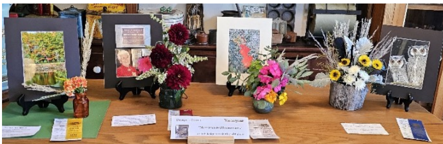
Photo Interpretation Meridian Garden Club Flower Show

For those who have never attended a flower show or have had limited access to a flower show, this was an opportunity to see a small-scale show. It helps you to understand what we will be