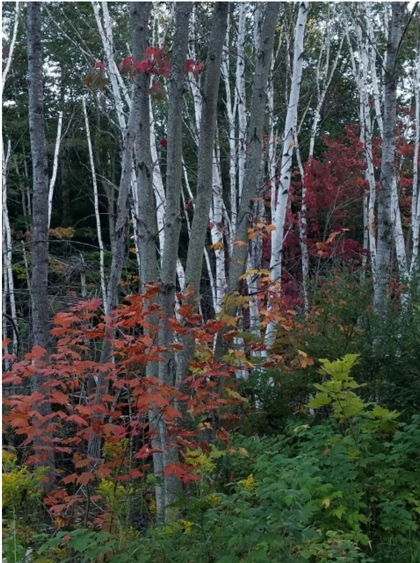
Trees in Gaylord

The Goldenrod is yellow, and the leaves are beginning to turn. In this beautiful season we watch the natural changes in our gardens and our environment as we put our plants to bed. As the temperatures drop, and the days grow shorter, deciduous trees and shrubs begin to prepare for the winter by losing their leaves. The name “deciduous” means the “dropping of a part that is no longer needed or useful”, and the “falling away after its purpose is finished.” As the weather gets cooler the tree forms a cork-like layer called “abscission cells” between the branch and the leaf stem. This barrier helps to keep the tree free from disease, and it also allows the leaves to fall easily in any mild breeze.