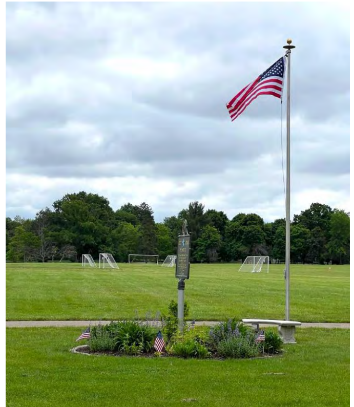
(Blue Star Memorial -Frances Park)