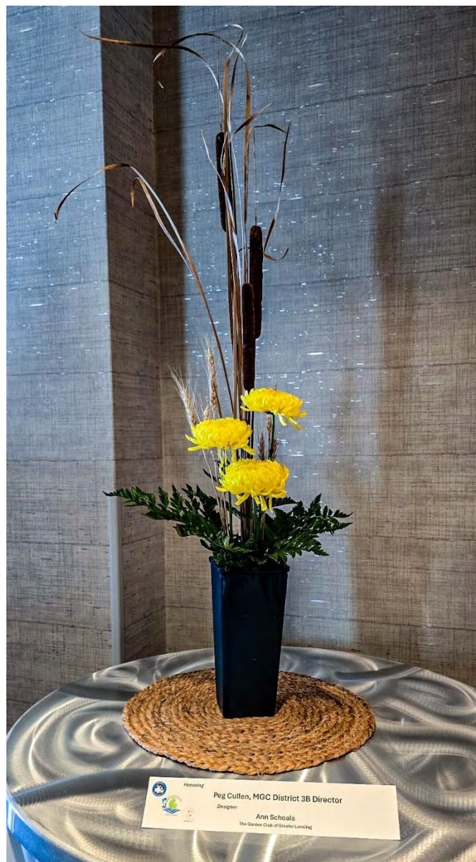
(Arrangement by Ann Schoals-MGC Conference)

Another very insistent grower is a native, green-centered cone flower. It must have had some help from the birds or the wind as it has popped up in several places in my front yard when it has been growing for years along the fence in the back yard. It is a very tall plant so this “plant out of place” is very obvious.