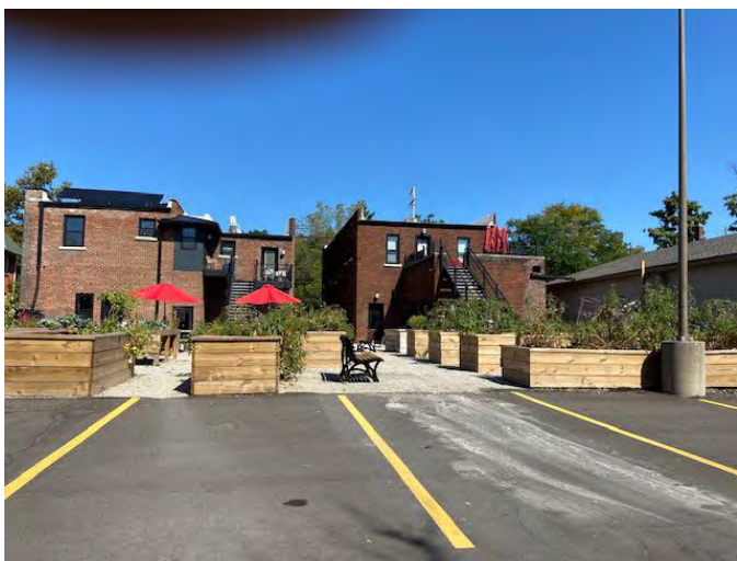
View of the garden from the church parking lot.

The First Presbyterian Church Community Garden is located about two blocks northwest of the Capital building, in what could be described as a food desert (a green space desert too). We started planning the garden in fall of 2019 and began what work we could do the following spring during the beginning of the pandemic.