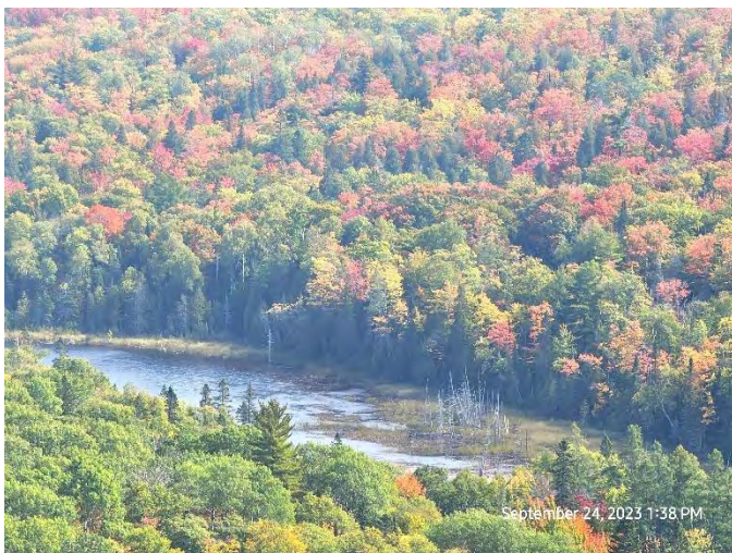
Brockway Mountain Keweenaw Peninsula

Sept., Oct., Nov., are my favorite months. The fresh and crisp air speak to me. It is screaming beautiful colors of orange, red, plums and gold. The smell of bonfires and roasted marshmallows, with the flavors of apple cider and donuts satisfies my tummy. It is a time of year that provides me great joy. I encourage you to take a drive to view the change in season. Even in the rain the colors look striking against dark or partly cloudy skies. Pop off to a cider mill, pick up pumpkins and gourds. We will have sun soon.