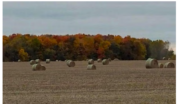
Hay that has been rolled with a colorful backdrop

School. She told us it is intense, well organized, lots of reading and a challenging test. I am sure we will have a new judge soon.