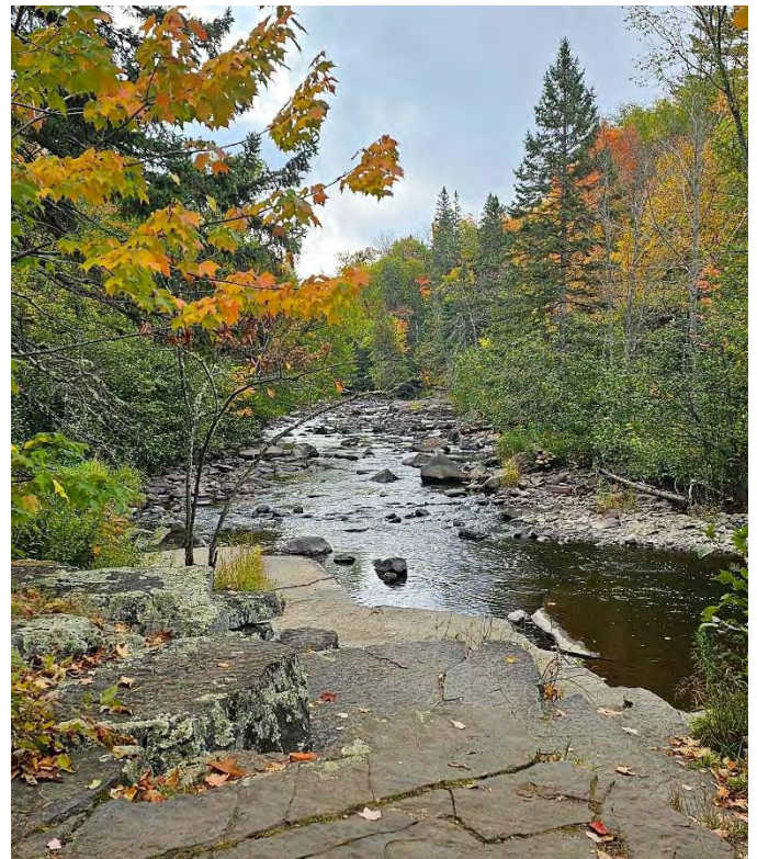
Canyon River Falls Upper Peninsula

Holly Jolly Flower Show , Youth and Adult Winter Flower Show for District 2B. Best Western, 2209 University Park Drive, Okemos, MI.