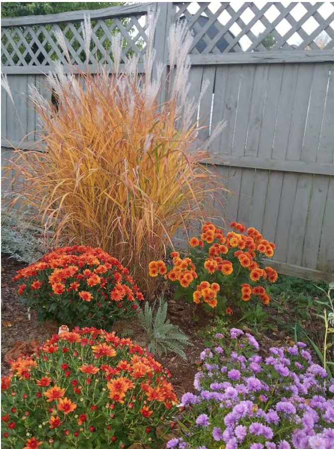
(Asters, mums and grasses)

Chrysanthemums bloom from September until frost. Most of the colors echo the fall leaves. Many mums are perennials and add attractive foliage throughout the growing season. They are easy to grow and become covered with blooms which vary from the more traditional rounded shapes to the twisted petals of spider mums. Annual mums are also beautiful but since they are adapted to warmer climates, they do not survive our winter weather.