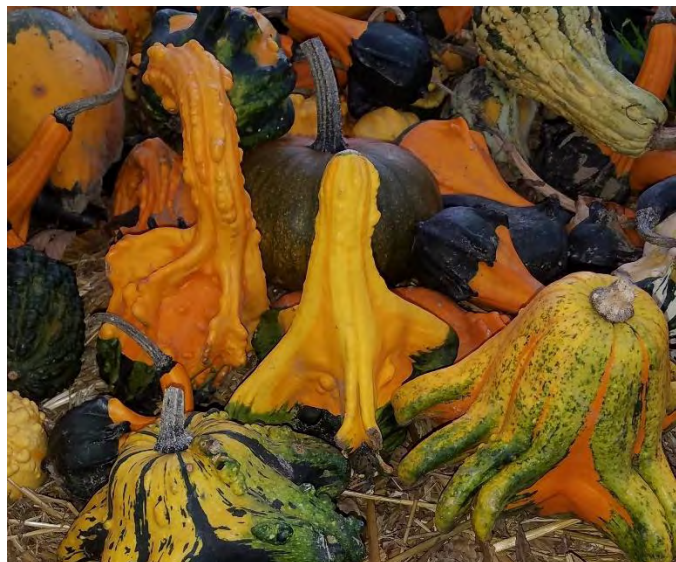
(Coming soon to local farmer markets)

I am so happy that we got together after a summer of business in garden visits and our tea. Thanks to ALL who brought flowers that filled our centerpieces. The team of people getting us ready for our meeting moved quickly and smoothly. Thanks hospitality and designer teams.