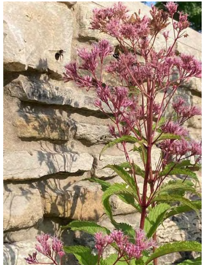
(Scott Sunken Garden – coming in for a landing)

This garden continues to thrive with different colors and lots of pollinators every week! Even the roses continue to bloom and vie for space with the giant hostas. Russian Sage is extra prolific along with butterfly bushes that are hiding thistle. What a display of purple!