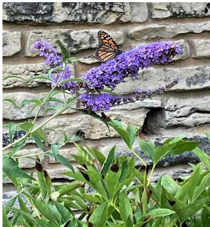
(Scott Sunken Garden – the butterfly has landed)

MGC Flower Show School, Course 1 Oct 5-6-7, 2023 in Ann Arbor, Zion Lutheran Church Piper Hall— Lower Level, 1501 W. Liberty Ann Arbor, Michigan 48103. Check the MGC website for details.