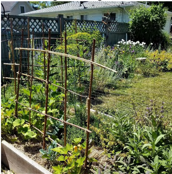
(Trellising with Ironweed and Miscanthus stalks)

My use for the plant was twofold. First, I wanted to hide the pole of wires that are placed in the right of way in between my yard and the neighbor's yard. Second, I was looking at the length and sturdiness of the stalks and thought I could use these for fencing and trellising.