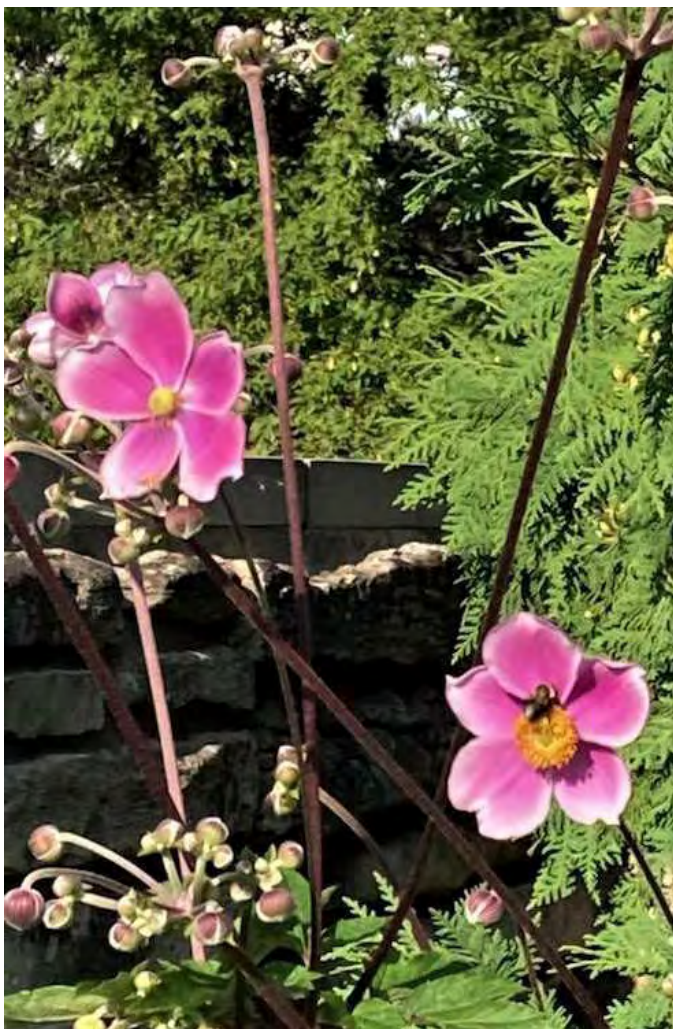
(Scott Sunken Garden Japanese Anemone/Windflower)