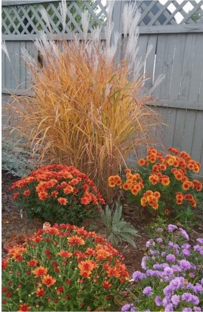
(Later in the morning the depth of color not as intense.)

The flower beds still needs some work. I have cut the ironweed and plan on making a fence for the drive to help with snow. I will also use it for designing winter interest in the garden. I have cut and weeded plants, leaves and flowers. Some of the flowers that I cut are being dried. I saved the seeds from zinnias, marigolds and snapdragons.