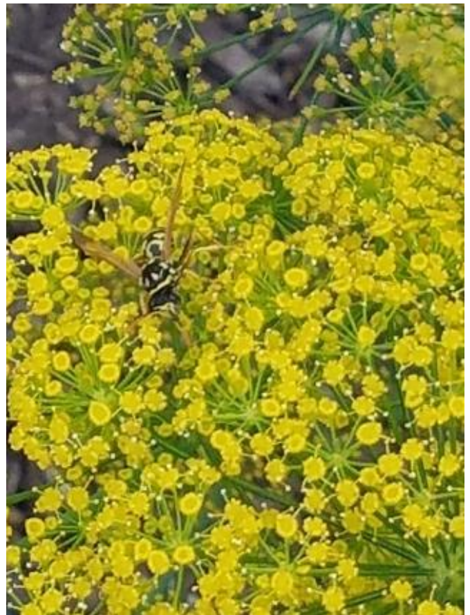
(Visiting bee on my dill)